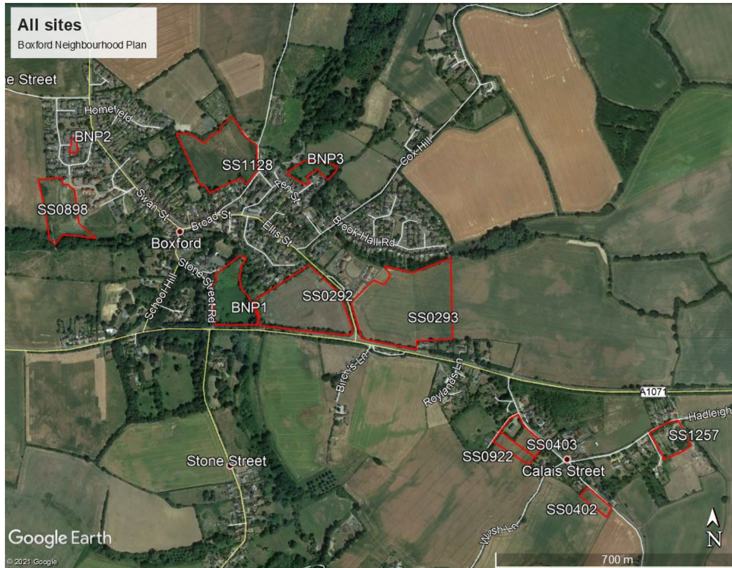
Figure 4-3 Map showing all sites included in the assessment