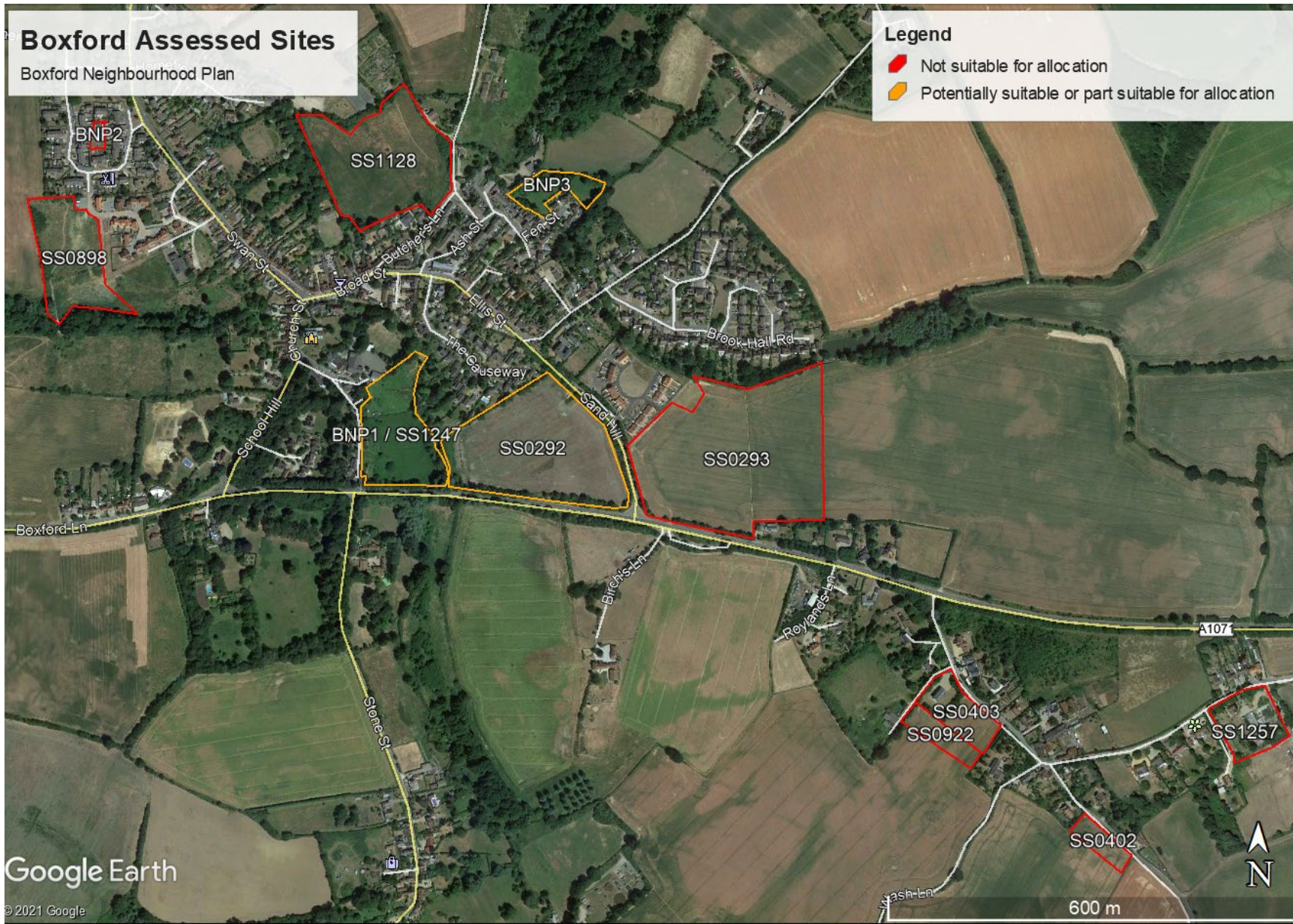
Figure 4-4 RAG rating map for all assessed sites